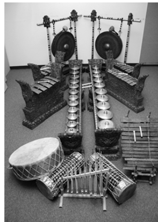
Some of the world instruments used in the Artism Music-Play Project. (Safety modifications are not shown)